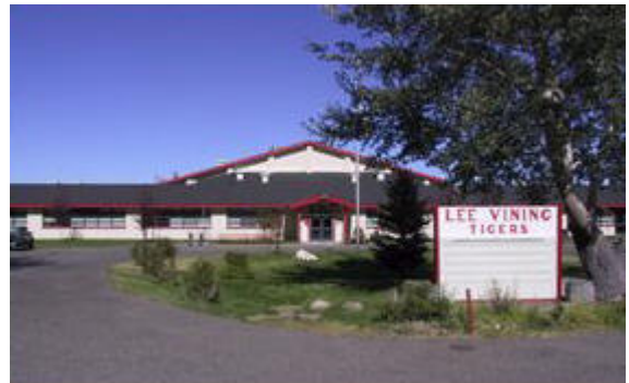
Lee Vining High School