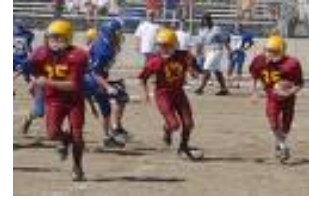
Trona’s sand field... “The Pit”